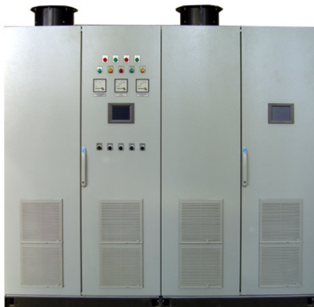
Fig. 1. STS-2P-160-1050 UHL static field system with 100% reserve