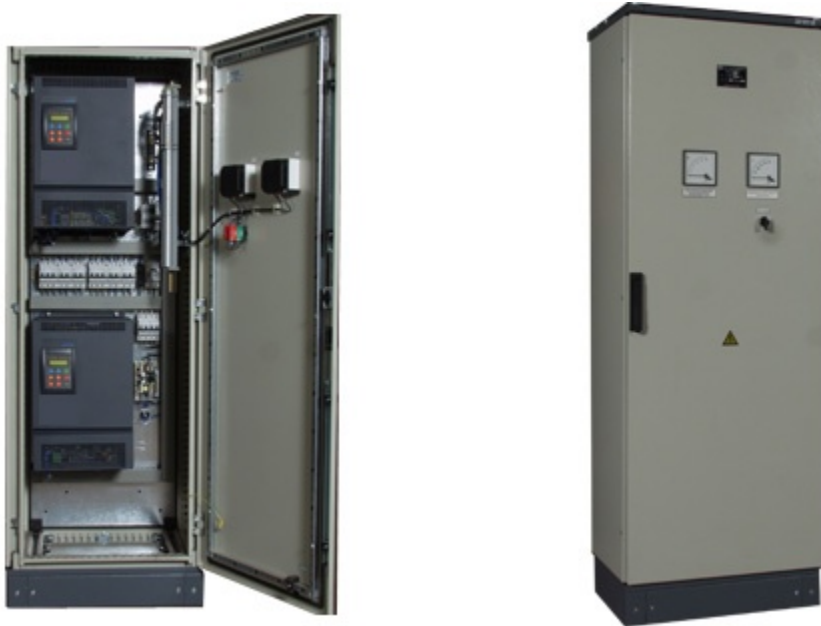
Fig. 2. General view of field control cabinet in two-channel embodiment

The regulator programmatically realizes all the functions of control, regulation, protection, diagnostics, and signaling on the field system state. Transitions from one channel to another are carried out automatically at occurrence of any malfunction prohibiting performance of its functions or at operator’s command. Power supply of each channel can be performed from the generator lead-outs, from the armature lead-outs through the power contact rings, and (or) from DC auxiliary mains. Initial excitation is performed from DC control mains.