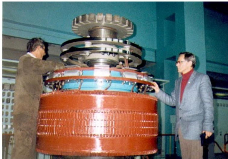
Fig. 1. General view of brushless exciter armature. Cascade of the Kuban HPS

Brushless exciter is synchronous generator with rotating armature. Its AC winding is located on the armature, and its field winding is located on the stator. The exciter armature is strongly connected through rotating diode rectifier with field winding of the hydrogenerator. Adjustment of generator excitation is performed by adjustment of exciting current of the exciter.