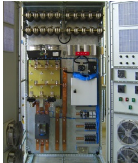
Fig. 2. EX-SR exciter for 1000 A current

EX-SR static exciter includes the following devices: