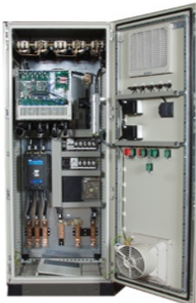
Fig. 1. EX-SR exciter for 400 A current